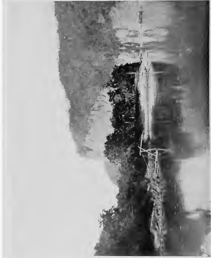
The Second Defile, Irrawaddy, Upper Burmah